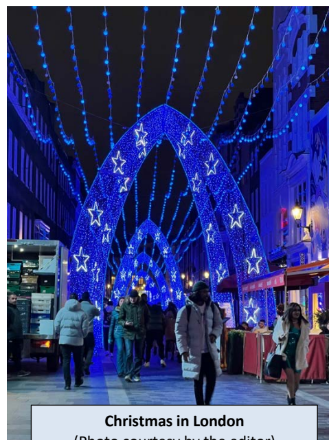
Christmas in London