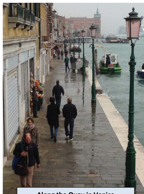
Along the Quay in Venice

My thanks go to several readers who all responded with the right answer, and with the right Rule: 35 (c). This is answer A, a vessel restricted in its ability to maneuver. The Rule also lists not under command, a sailing vessel, a vessel engaged in fishing, and a vessel engaged in towing or pushing. We call those the 'encumbered vessels.'