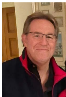
The Ships' Mail.