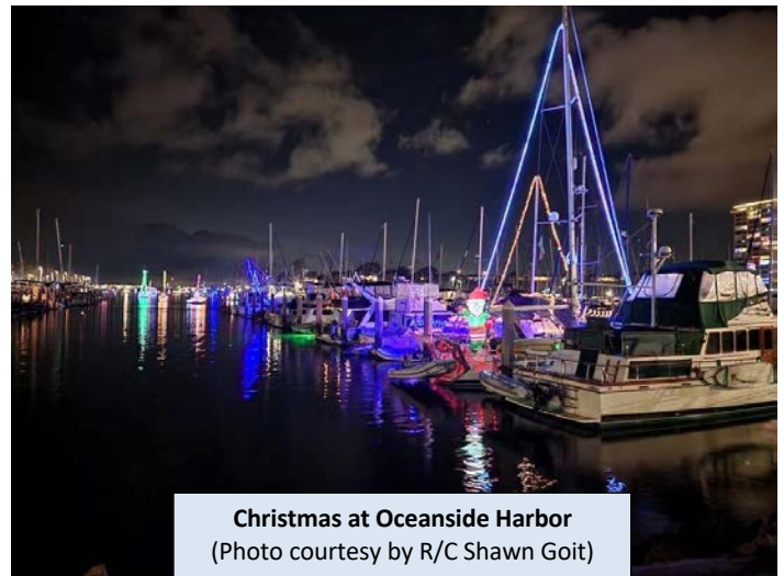
Christmas at Oceanside Harbor

The leadership in the club is energized and has lots of new ideas they want to try to implement in 2023. Come to our GMMs, picnics and BBQs to find out what is going on!! We also have lots of old and new opportunities to get involved. There are various committees and small tasks that we need support. Come out and offer a few hours of time. Many hands make light work. It is a great way to keep in touch with your fellow boaters. Contact me if you are interested!!