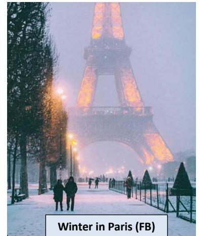
Winter in Paris (FB)