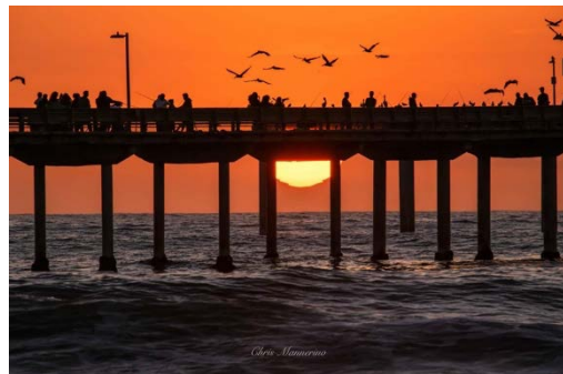
Sunset in Ocean Beach