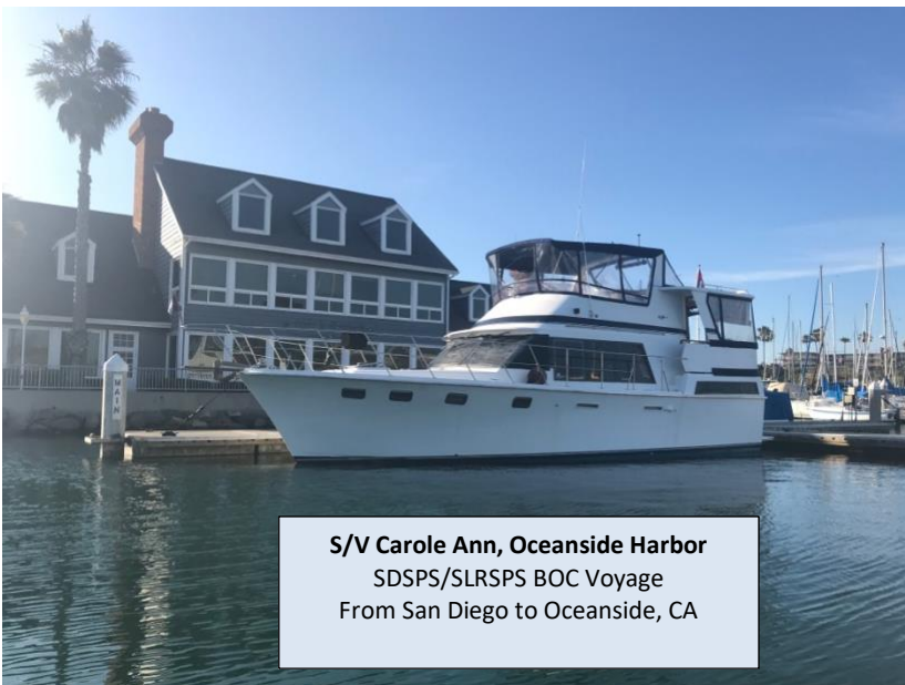
S/V Carole Ann, Oceanside Harbor SDSPS/SLRSPS BOC Voyage From San Diego to Oceanside, CA

We left the dock in Oceanside at about 1500, entered the Pacific Ocean and continued southward to San Diego for our return voyage. We were able to see the shoreline, so we were able to take several bearings, fixing our position on a chart, in addition to using GPS and all of us also practiced helmsmanship, driving the boat on the course, without the help of GPS using only our compass for direction. We also practiced calculating our arrival time at subsequent waypoints using our "60 DST" calculations. Each of us was successful at arriving at every waypoint at the expected time.